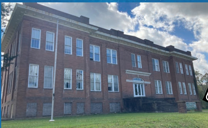
The historical Brumfield building will be renovated with the help of a $500,000 AHP subsidy from Tensas State Bank and FHLB Dallas.