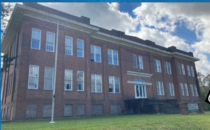
The historical Brumfield building will be renovated with the help of a $500,000 AHP subsidy from Tensas State Bank and FHLB Dallas.